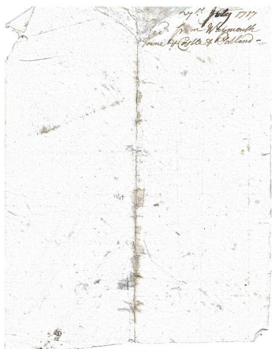
27<sup>th</sup> July 1717 Rec<sup>d</sup> from Weymouth Towne & Castle & Portland