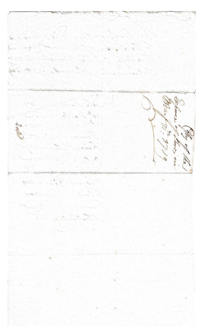
Copy of the Expence of stores in May 31<sup>st</sup> 1719